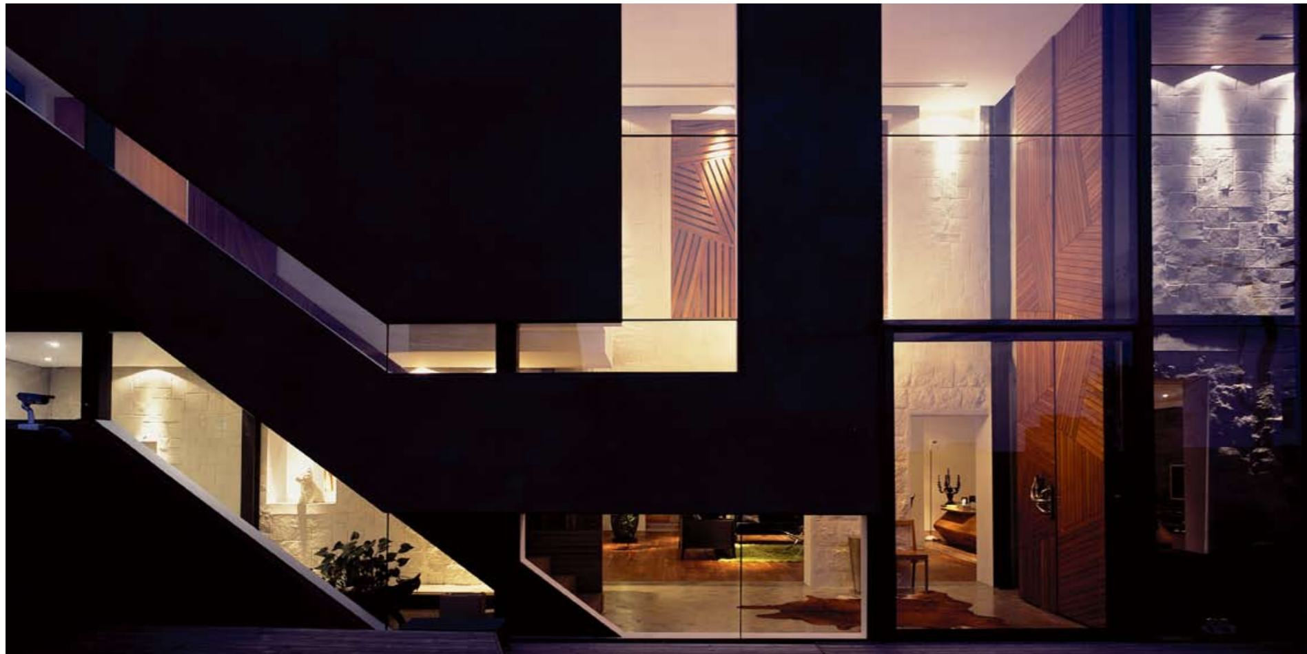
Above Ant Farm House, Taipei / Xrange